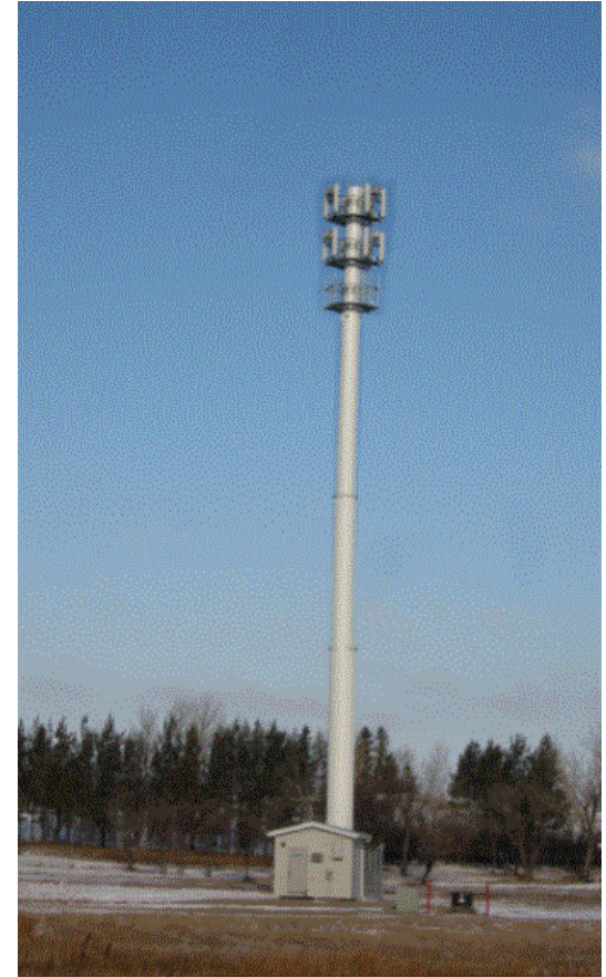
A typical photo of the proposed monopole.

Proposed tower will be located in the Craven Festival Grounds